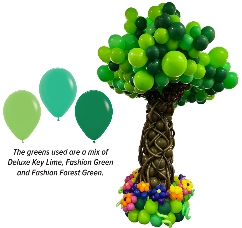
The greens used are a mix of Deluxe Key Lime, Fashion Green and Fashion Forest Green.